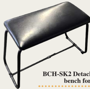
BCH-SK2 Detachable bench for SK2