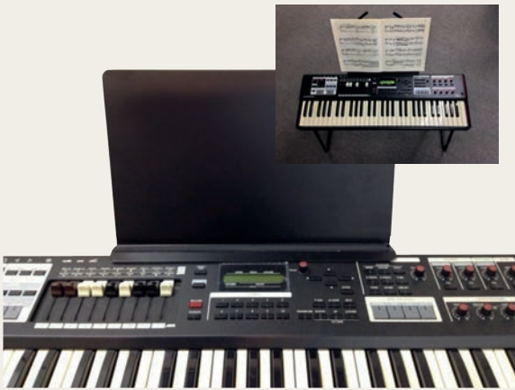
MR-SK Music Rest for SK1 and SK2 (for SK1 only in combination with ST-SK1 stand)