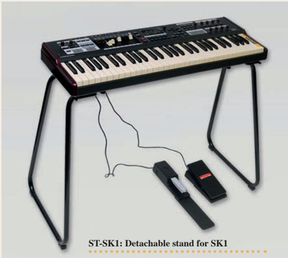
ST-SK1: Detachable stand for SK1