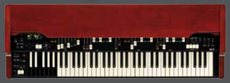
The XK-5 System is a modular system and can consist of: